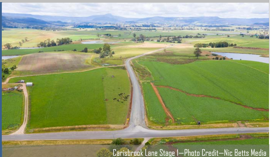
Carisbrook Lane Stage 1

Planning works for Stage 2 which will be from McDougalls Road to Main Street and includes a stock underpass have commenced.