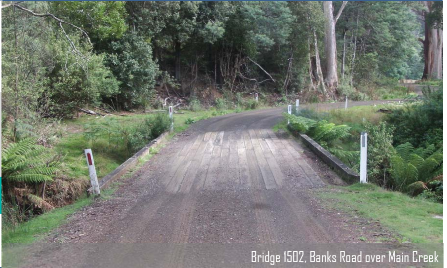
Bridge 1502, Banks Road over Main Creek

Bridge 1588 Dafts Road . Planning is underway for a full redeck.