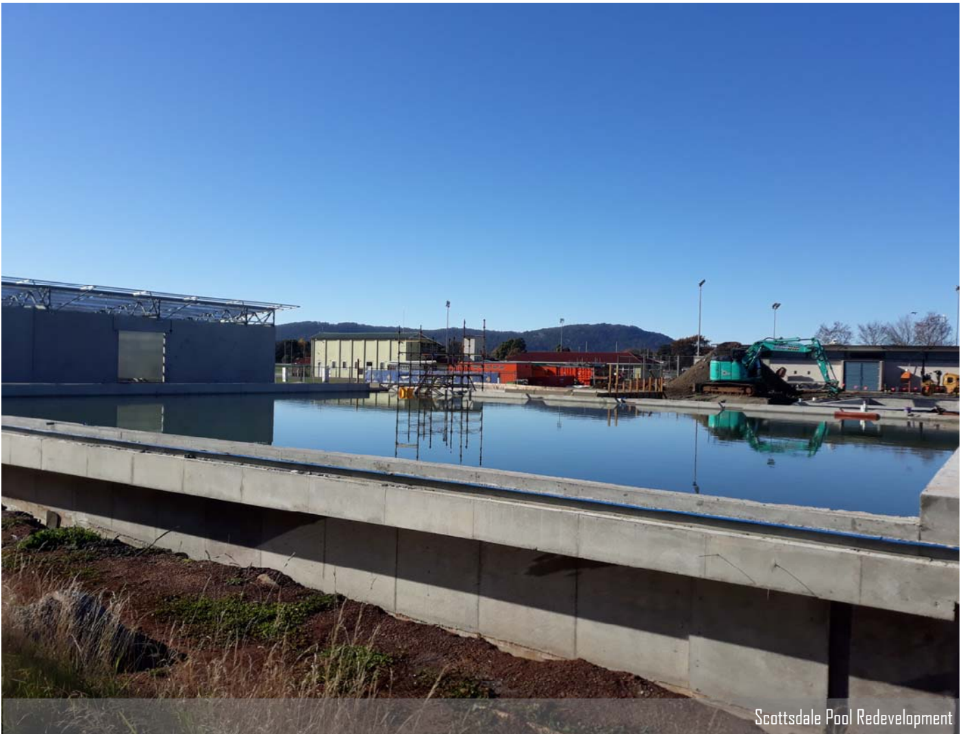
Scottsdale Pool Redevelopment

Work on the multi million dollar Scottsdale Pool Redevelopment is progressing well. The project, which is due to be completed in time for the upcoming swimming season is set to impress young and old alike. The redeveloped facility will boast a 25m lap pool, a Learn to Swim pool and a Leisure Pool complete with Splash Pad Water Play area.