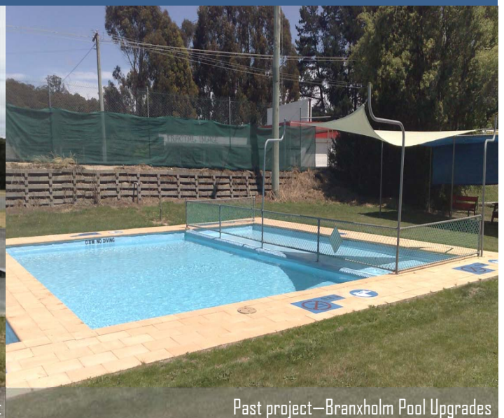
Past project—Branxholm Pool Upgrades

PO BOX 21, SCOTTSDALE T- (03) 6352 6500 E— dorset@dorset.tas.gov.au