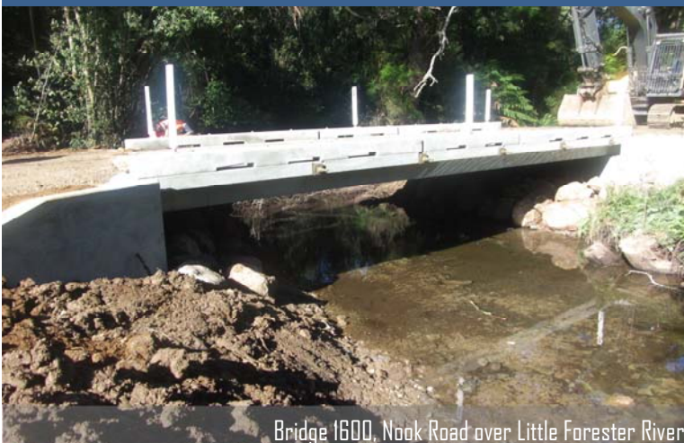
Bridge 1600, Nook Road over Little Forester River

Funding has also been successful for Golconda Road Stage 4 (2.0km section) through the Safer Rural Roads 2020-21 Round 2 Program.