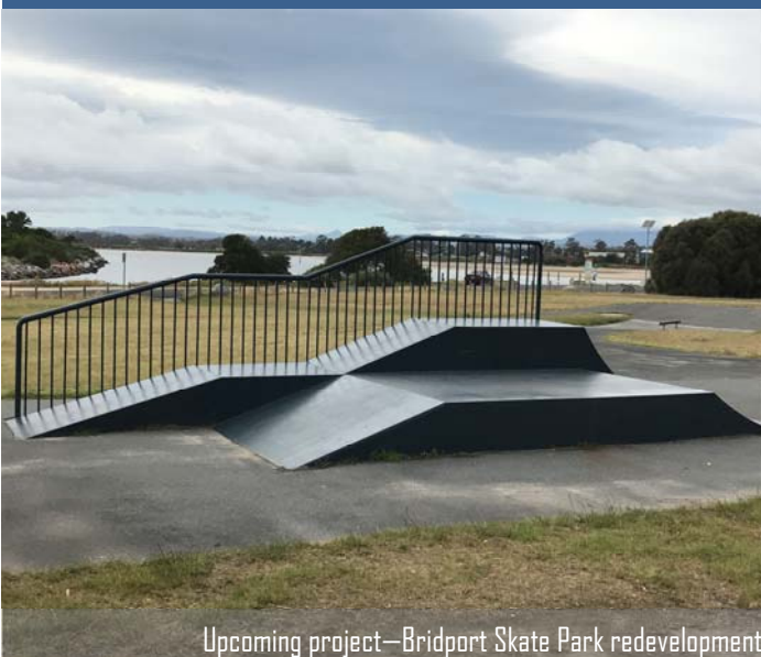
Upcoming project—Bridport Skate Park redevelopment

During the tour the Councillors were able to witness up close the redevelopment of the Scottsdale Pool and chat directly with the contractor to gain a better understanding of the project and it's progress. They also toured some of the main facilities and halls throughout Dorset and gained a visual understanding on what projects are due to be delivered in the upcoming financial year.