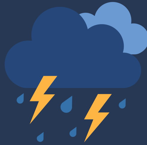
Storm/ Severe Weather