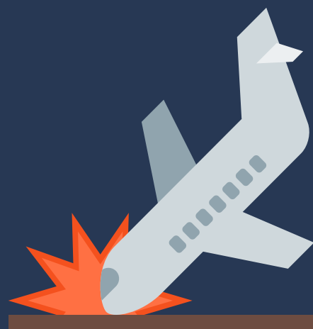
Train, Plane or Marine Crash