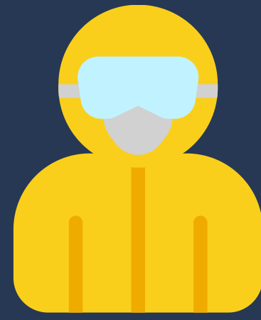
Hazardous Materials (incl Radiological)