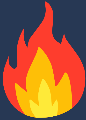
Fire - Urban, Structural and Private Rural Land