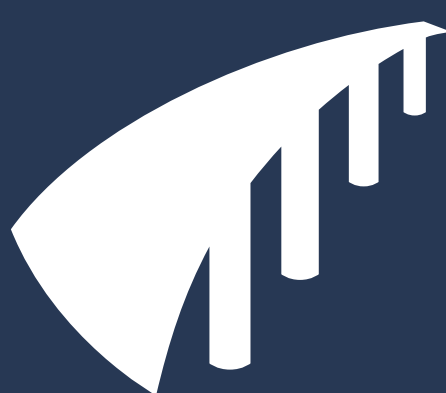
Infrastructure Failure Roads & Bridges (DSG)