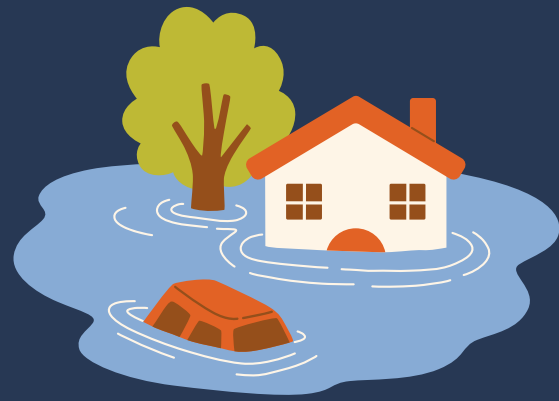
Flood - Flash and Riverine