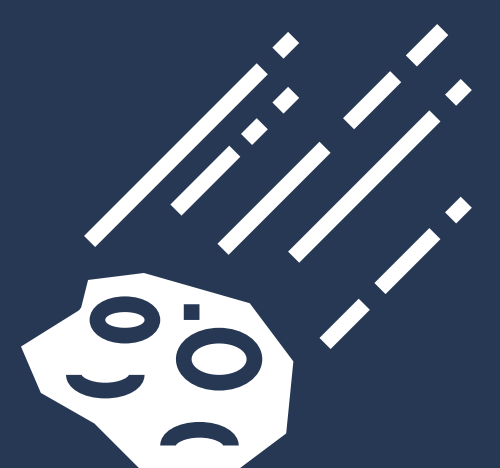
Space Debris (DPFEM)