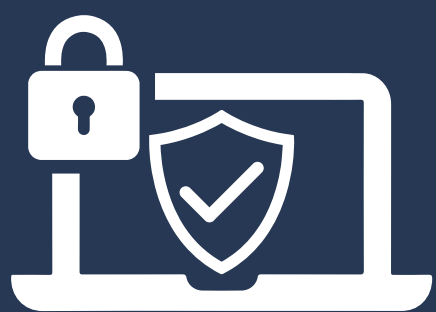
Cyber Security (DPAC)